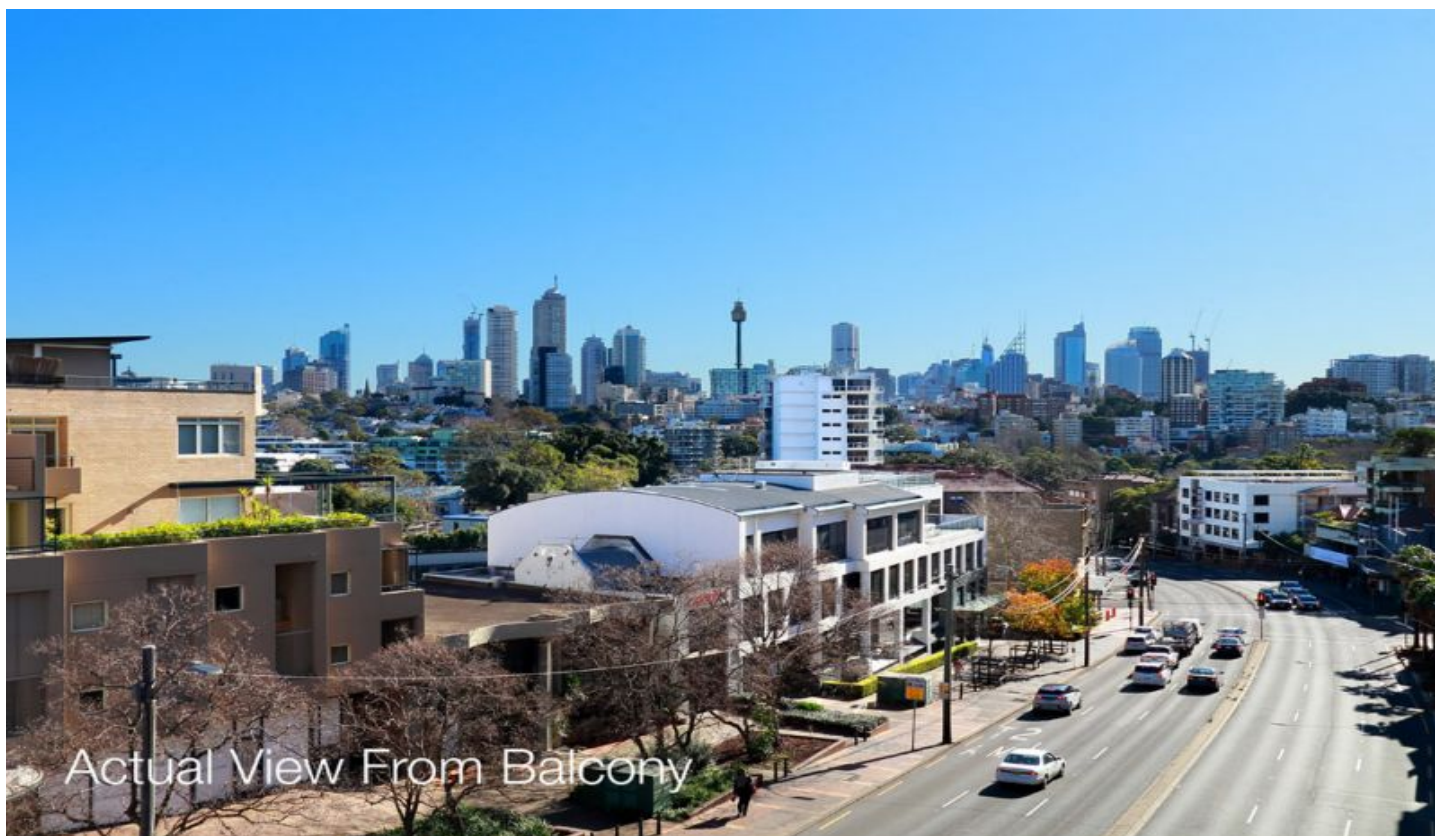
Actual View From Balcony